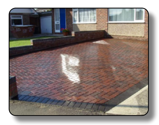
Concrete cures and sealers