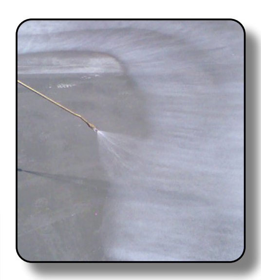
Solvents and form oils