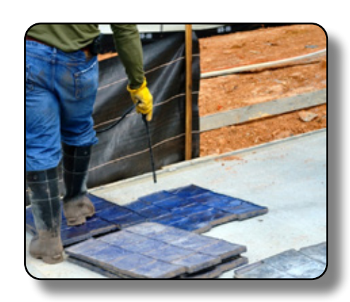
Xylene and toluene